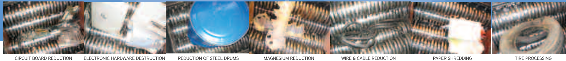
CIRCUIT BOARD REDUCTION